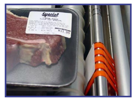
Add the Model 710 for Bottom Labeling Capability