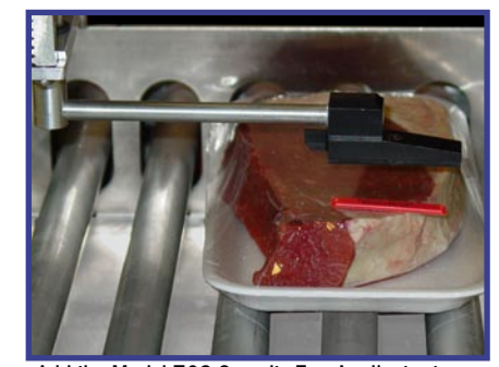
Add the Model 703 Security Tag Applicator to secure your profits.