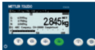
ICS429, standard display mode