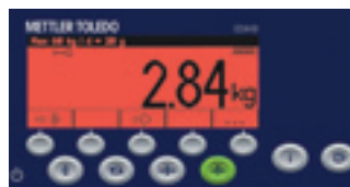
ICS449, big fonts display mode