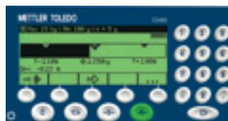
ICS469, 3 line display mode

The colorWeight backlight function offers individual color settings to optimize your process and improve productivity. Use the take away function for repeated manual portioning and increase your process accuracy. Piece counting functions included.