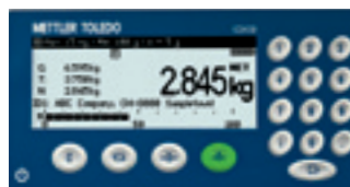
ICS439, standard display mode

All you need for straight forward basic weighing applications. Simple to operate with only 7 keys for fast and stable results. Simple and intuitive.