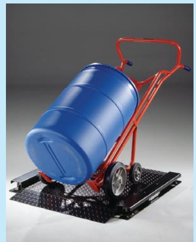
Ultra-low profile makes it easy to wheel heavy containers onto the scale.