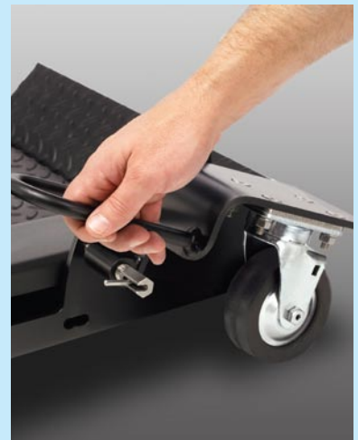
Portable 30x30-inch scale fits easily through standard doorways. Hinged ramps fold out of the way when scale is moved or stored.