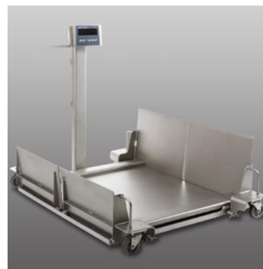
Stainless steel DECKMATE floor scale for sanitary applications.

Our load cells are approved for use in hazardous areas in most markets. DECKMATE load cells carry Factory Mutual, European Ex, and Canadian CSA Ex approvals when used with a METTLER TOLEDO intrinsically safe terminal.