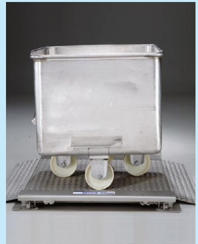
Choose from 304 or 316 stainless steel for the level of corrosion resistance you need.