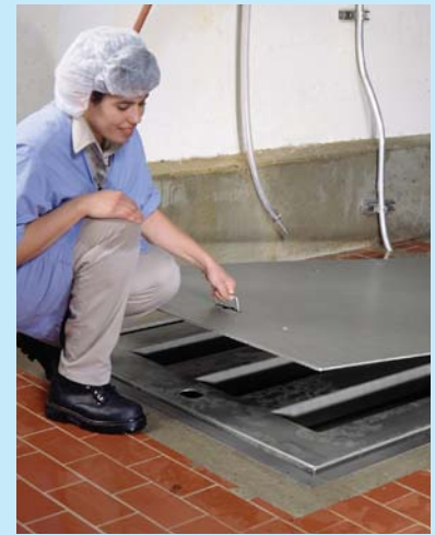
The EZ-LIFT scale has gas-pressurized struts that make it easy to lift the platform for cleaning.