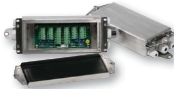
IP69K junction box for extra protection.