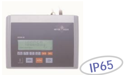
Benchtop model (with cable exit at rear) Wall/stand-mount model (with cable exit below)