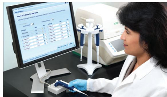
The optional RFID reader works with all Rainin RFID-enabled pipettes, and interfaces with METTLER TOLEDO's LabX™ Direct Pipette-Scan™ calibration check.