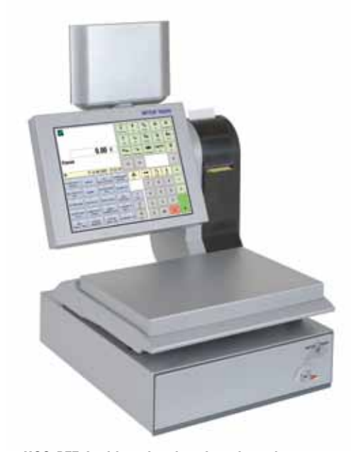
UC3-RTT-A with optional cash register drawer