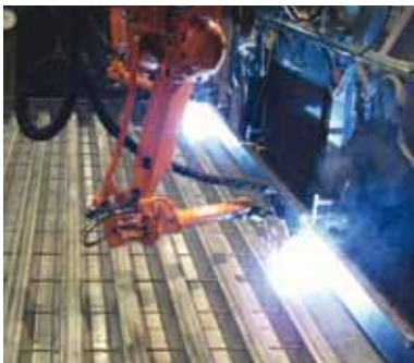
Modules are robotically welded to meet the highest quality standards.

The result is the same high quality for every scale, every time.