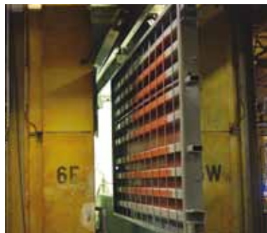
Metal surfaces are coated with a two-part epoxy finish to protect against corrosion.

The end result is a durable finish that protects against the corrosion and contaminants that can shorten the life of a scale.