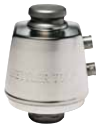
POWERCELL® PDX® Load Cell

As the global leader in weighing, we offer a full line of truck scales and accessories to meet your weighing needs. Only one line of truck scales is accurate enough, reliable enough, and durable enough to carry the METTLER TOLEDO name.