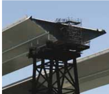
Our scales have the same orthotropic design used for many high-traffic roadway bridges.

When a highway bridge fails, the results can be catastrophic. Many bridge designers are now turning to orthotropic ribs as a better alternative to older support structures because of the proven strength, reliability, and longevity. Give your weighbridge the same durable orthotropic design that is being used for today's highway bridges. Don't let a failed weighbridge be catastrophic for your business.