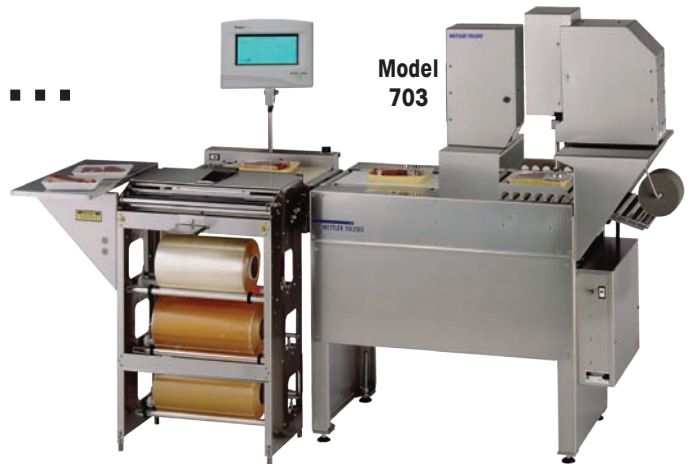
Model 703 Applicator shown on Model 706 Auto-Labeler®

The 703 operates with several current and previously offered Auto-Labelers, including the Model 705, 706, and 606. Loading the tag roll is easy and uses the Sensormatic tags designed specifically for meat trays.