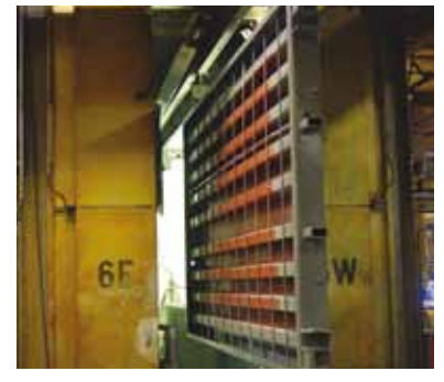
Metal surfaces are coated with a two-part epoxy finish to protect against corrosion.

Our six-step product development process is the most comprehensive design, analysis, and testing program in the industry. It delivers scales with the proven ability to meet the demands of your weighing application. No other manufacturer designs and tests truck scales this thoroughly.