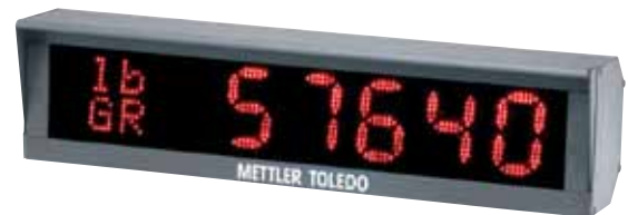
ADI310 Remote Display