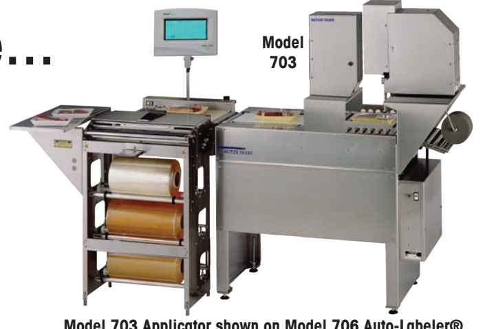
Model 703 Applicator shown on Model 706 Auto-Labeler®

The 703 operates with several current and previously offered Auto-Labelers, including the Model 705, 706, and 606. Loading the tag roll is easy and uses the Sensormatic tags designed specifically for meat trays.