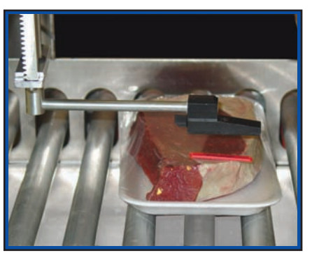
Tag is applied to wrapped tray, and then price label is applied over tag