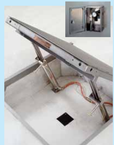
Pneumatic control and cylinders automatically lift the EZ-CLEAN scale for cleaning.