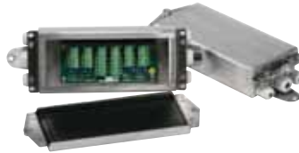
IP69K junction box for extra protection.