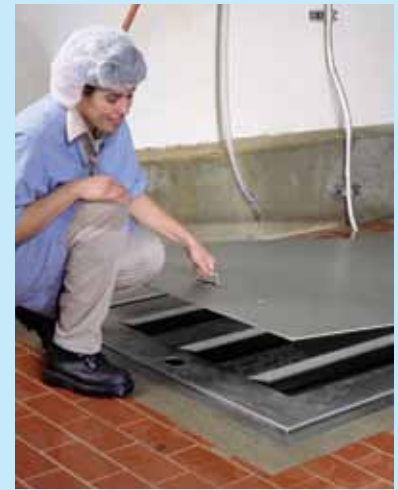
The EZ-LIFT scale has gas-pressurized struts that make it easy to lift the platform for cleaning.