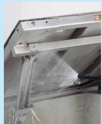
The EZ-CLEAN scale tilts up 45 degrees to expose the underside and pit for washdown.