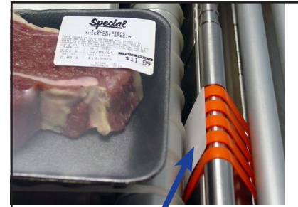
Closeup of bottom label in delivery position.

Mettler-Toledo USA 1900 Polaris Parkway Columbus, Ohio 43240 TEL. (800) 883-2171 (614) 438-4511