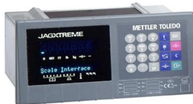
JAGXTREME Scale Terminal

For applications requiring both attended and unattended weighing, the UWT™ can be connected to a JAGXTREME operator interface (JXOI) unit located in the scale house. This allows scale house personnel to operate the scale during high volume periods, and the driver to operate the scale via the UWT™ during lower volume periods.