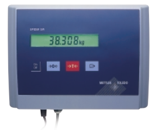
Wall/stand-mount model (with cable outlet below)