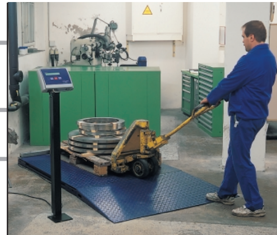
Weighing ranges up to 3 tonnes and rugged construction make the Spider SW a match for even the toughest tasks.