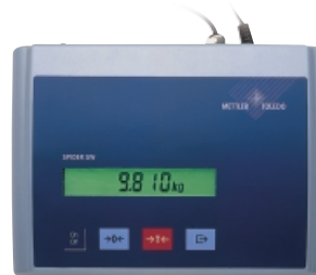
Benchtop model (with cable outlet at rear)