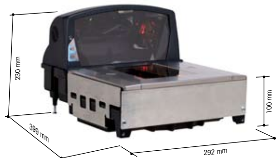
Stratos N Dimensions - 2400 Series