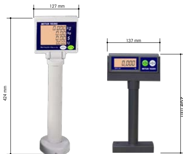
Price Computing Display