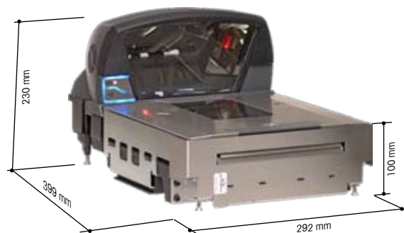
Stratos S Dimensions - 2200 Series