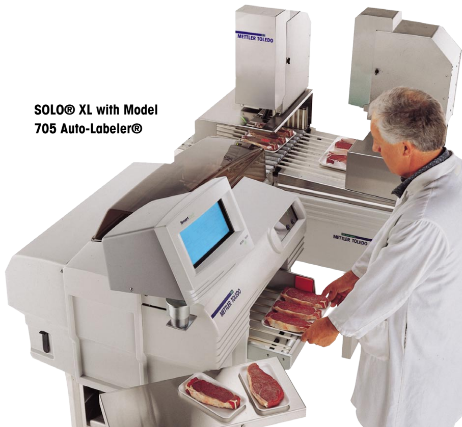
SOLO® XL with Model 705 Auto-Labeler®

Add the Model 710 Bottom Printer for enhanced merchandising possibilities and more attractive packages for your customers. Secure your products with the Model 703 Security Tag Applicator.