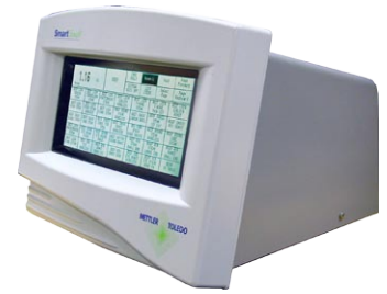
Model 8361 SmartTouch® Prepack Controller