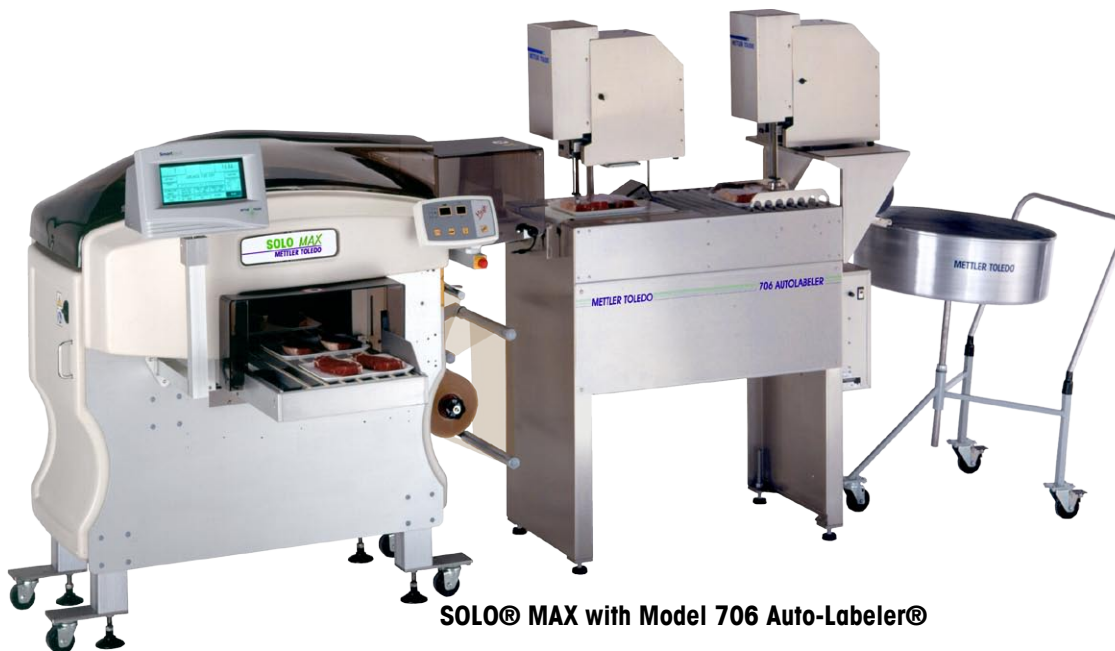
SOLO® MAX with Model 706 Auto-Labeler®