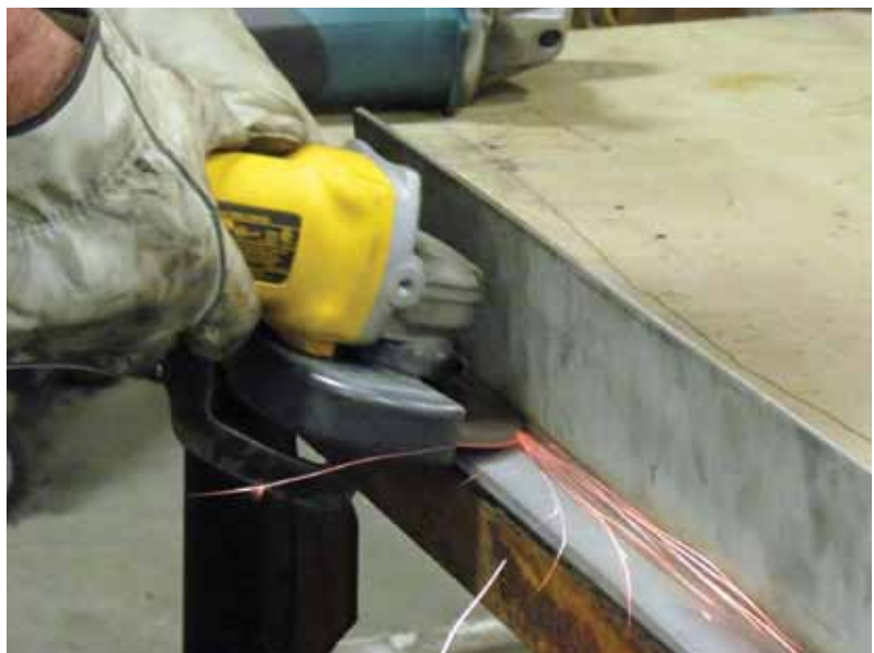
For sanitary applications, welds are ground smooth before a scale is polished.