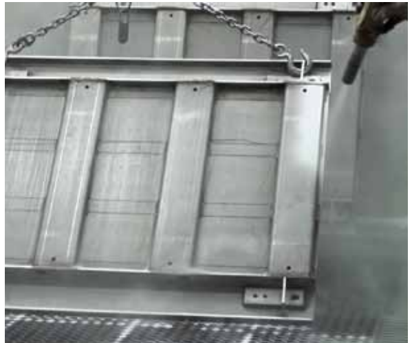
Our standard finish for stainless steel floor scales is provided by glass bead blasting.