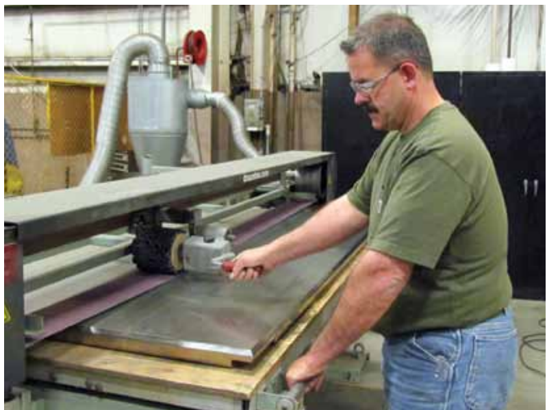
An in-house stroke belt sander is used for polishing floor scale platforms to meet the requirements of sanitary applications.

A smooth-plate platform is our basic offering for stainless steel floor scales in wet environments. Although it is an easy surface to clean, it provides very little traction, especially when wet. Tread plate improves footing in dry applications, but its benefits are limited when the platform is wet. Adding to its limitations is the fact that it is available only for type 304 stainless steel.