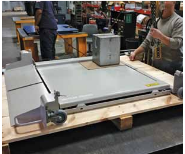
Carbon steel scales can be coated with special paints that resist the corrosive effects of acids and other chemicals.

Our standard glass-bead-blasted finish produces a 70-95 Ra value. Electropolishing is a chemical treatment that produces a very shiny surface with a 70-100 Ra value. When applications require stainless steel with lower Ra values, mechanical polishing is an