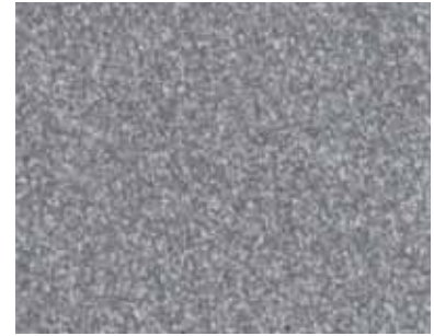
SlipNOT® surface is applied using a plasma-stream process that deposits a random hatch matrix on the metal substrate.