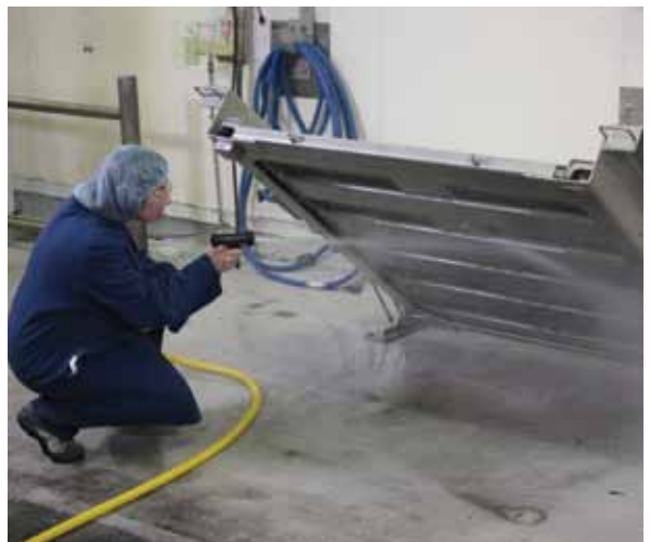
Stainless steel floor scales can be supplied with custom finishes for use in a variety of washdown applications.