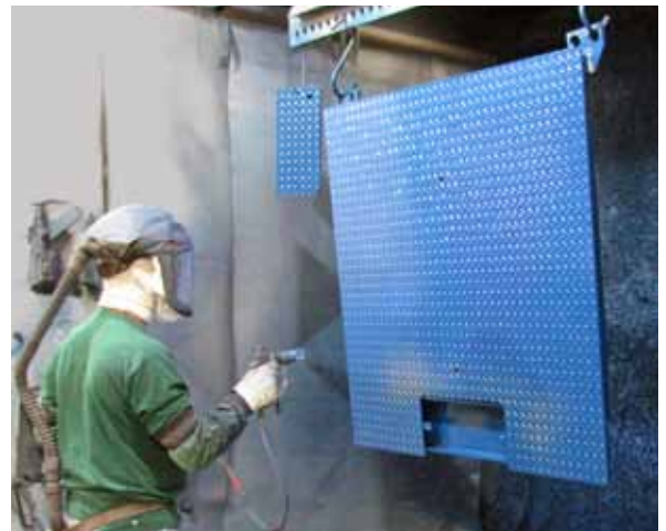
Carbon steel floor scales are given a protective coating of two-part epoxy paint.

Carbon steel depends on a high-quality painted finish to protect against corrosion. We use a three-step finishing process: (1) blast the metal with steel grit/shot, (2) coat the metal with a two-part epoxy paint, and (3) treat the painted metal in a curing oven. This process provides a durable, protective finish that is suitable for many industrial applications.