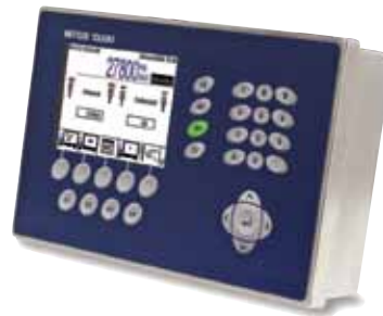
Optional IND780 scale terminal